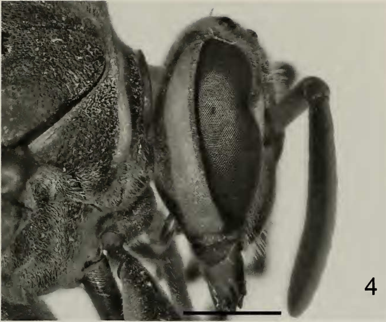
Figs 1-8. Continued.

hairs present, sparser and shorter than those of frons which are nearly as long as bristles of clypeus below level of eyes. Base of mandible with raised rim, forming an